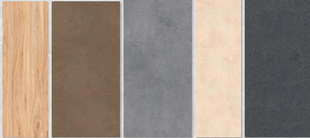
800 x 2400